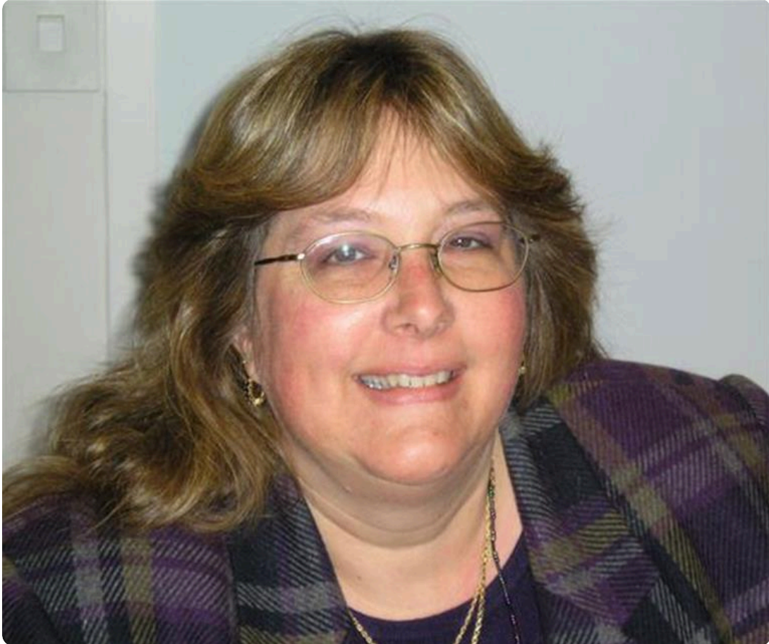
What great smile she had.